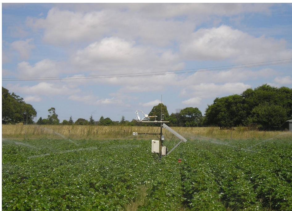
FIGURE 2. Evapotranspiration being measured during irrigation with the ECV system