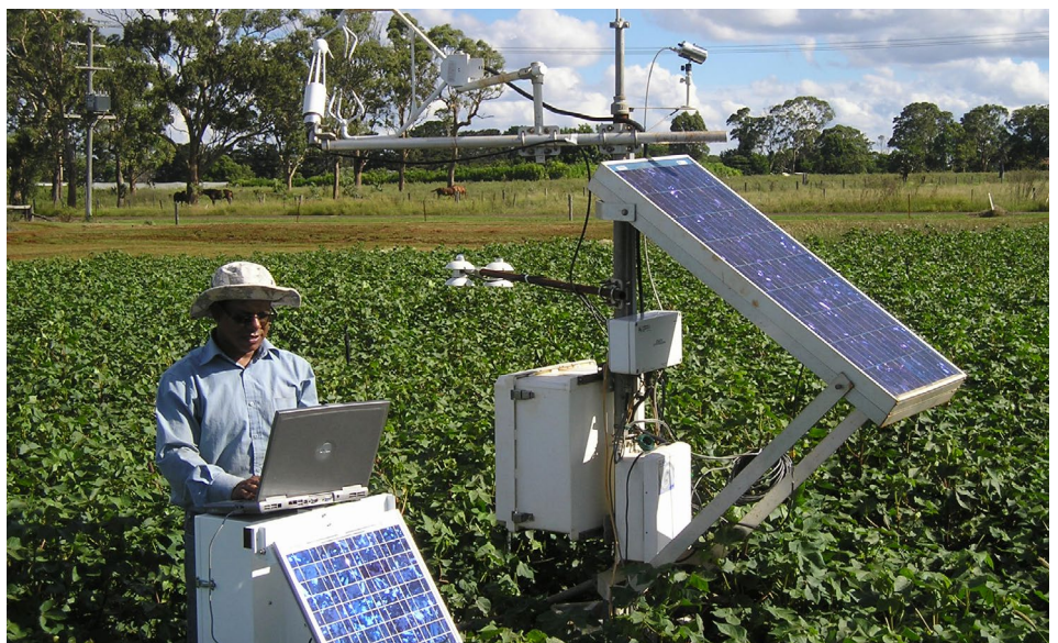
FIGURE 1. Installed ECV and sap flow system at the centre of the field for continuous measurements

The study was conducted over a cotton crop at the Agricultural Experimental Station situated at the University of Southern Queensland, Toowoomba, Australia. Eddy covariance system consisting of a 3D sonic anemometer and