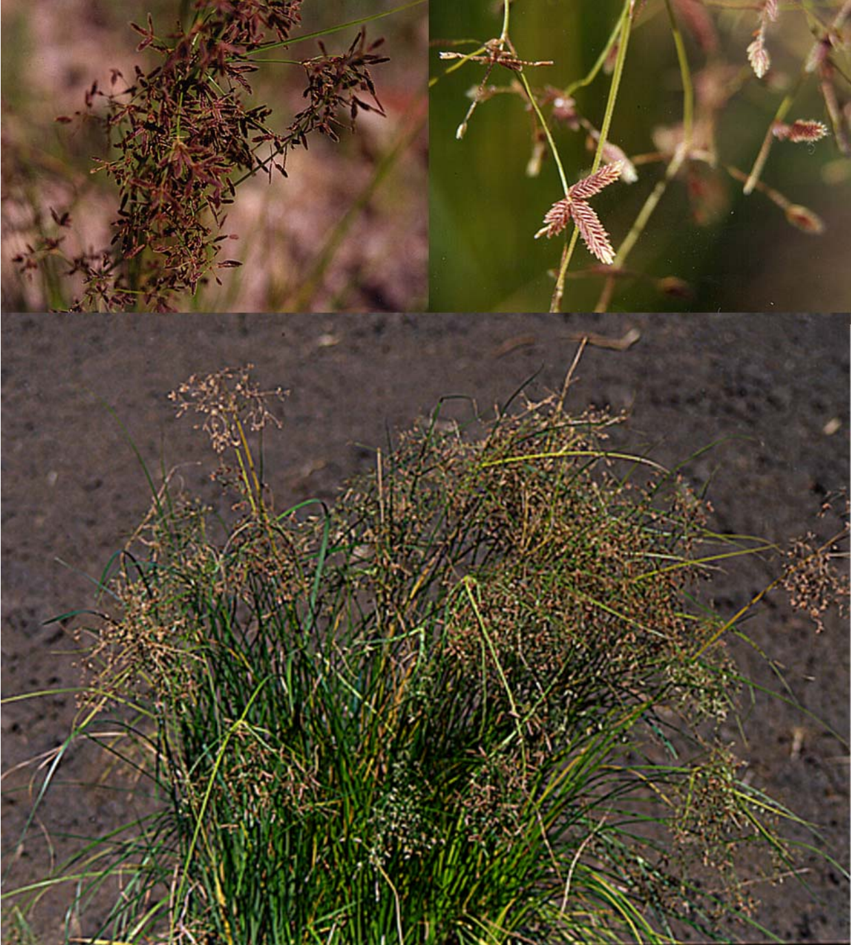
Trim sedge occurs sporadically on wet areas and table drains.