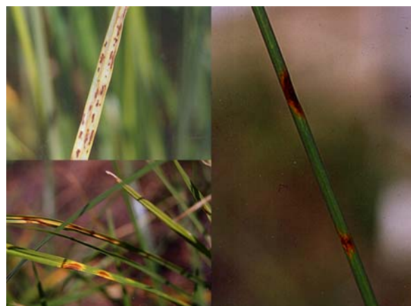
Leaf rust on nutgrass (top left), and downy mildew on nutgrass (bottom left) and stem rust on yelka plants (right).

The possibility of biological control of nutgrass has been examined in a number of countries, but has not been effective in significantly reducing weed numbers.