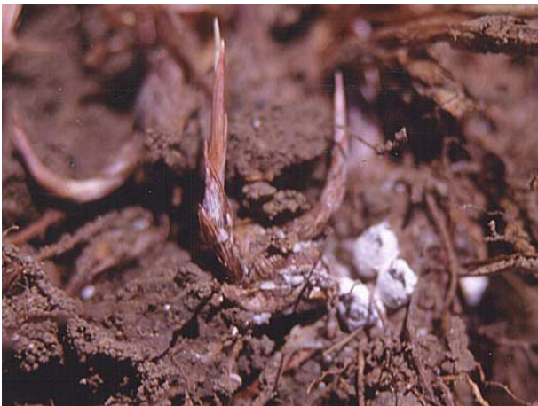
Nutgrass tubers and shoots parasitised by a scale insect (white spheres).