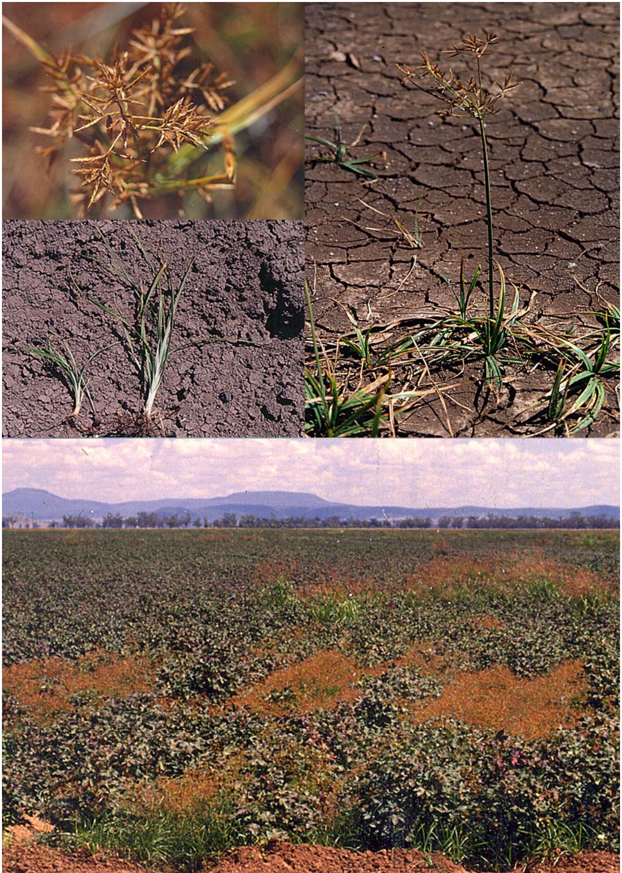
Downs nutgrass is a native perennial weed commonly found in the watercourse country. It is not very competitive with cotton, but can be very obvious due to its height and colourful flower heads.