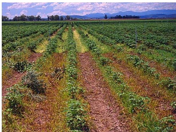
Sempra® applied through a shielded sprayer (foreground plot) controlled nutgrass in the furrow (sprayed area), but gave little control of the unsprayed plant-line.