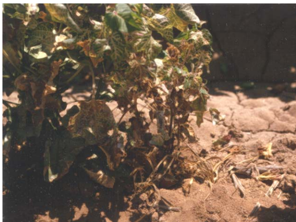
Cotton and nutgrass on a light, acid soil in Arizona severely affected by 1.5 kg of Zoliar.

Zoliar is best suited to light, acid soils, where it is very effective at relatively light rates. In Arizona (USA), for example, Zoliar is very effective when applied post-cotton emergence at 1.5 kg/ha, but will kill cotton if applied pre-planting at this rate. Lighter rates should be used when applying Zoliar to light acid soils in Australia.