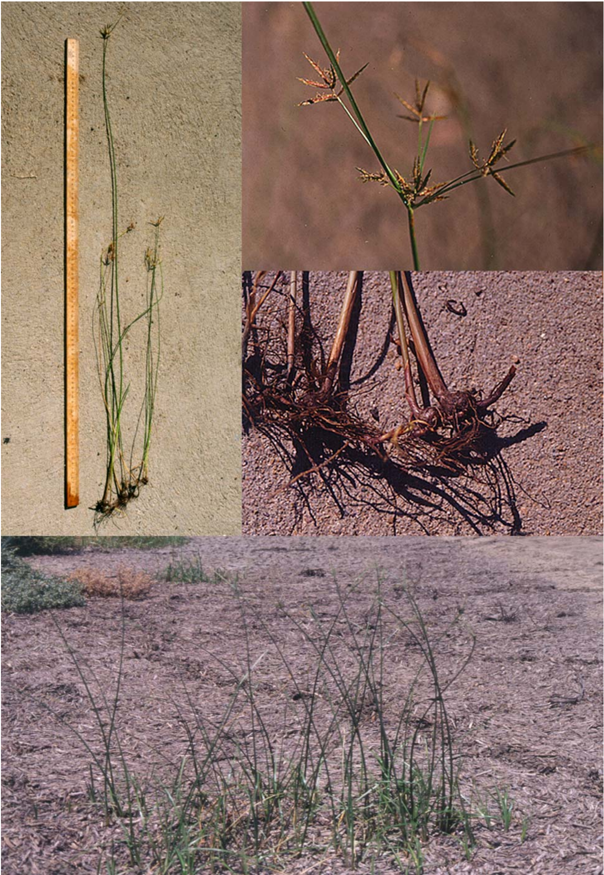
Yelka is a native weed commonly found on roadsides and waste areas. It is tall, but has few leaves and grows at relatively low densities.