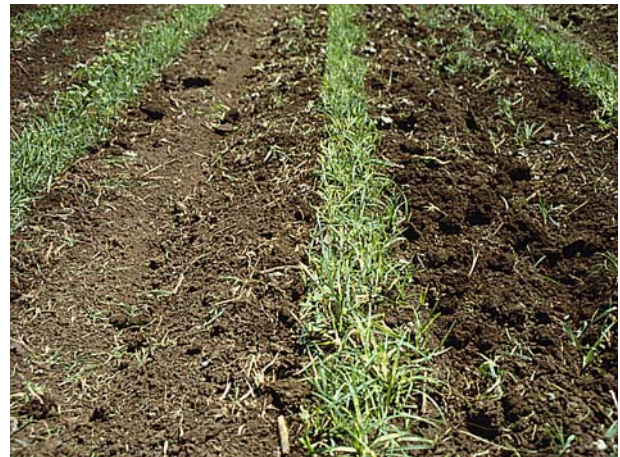
Inter-row cultivation can be useful for suppressing very heavy nutgrass infestations, but has the major limitation that it can't control nutgrass in the cotton plant line.

Inter-row cultivation is usually ineffective in controlling nutgrass in cotton, as cultivation generally occurs at relatively high soil moisture content to avoid excessively damaging the cotton, and is not deep enough to fully sever the roots of nutgrass plants and tubers.