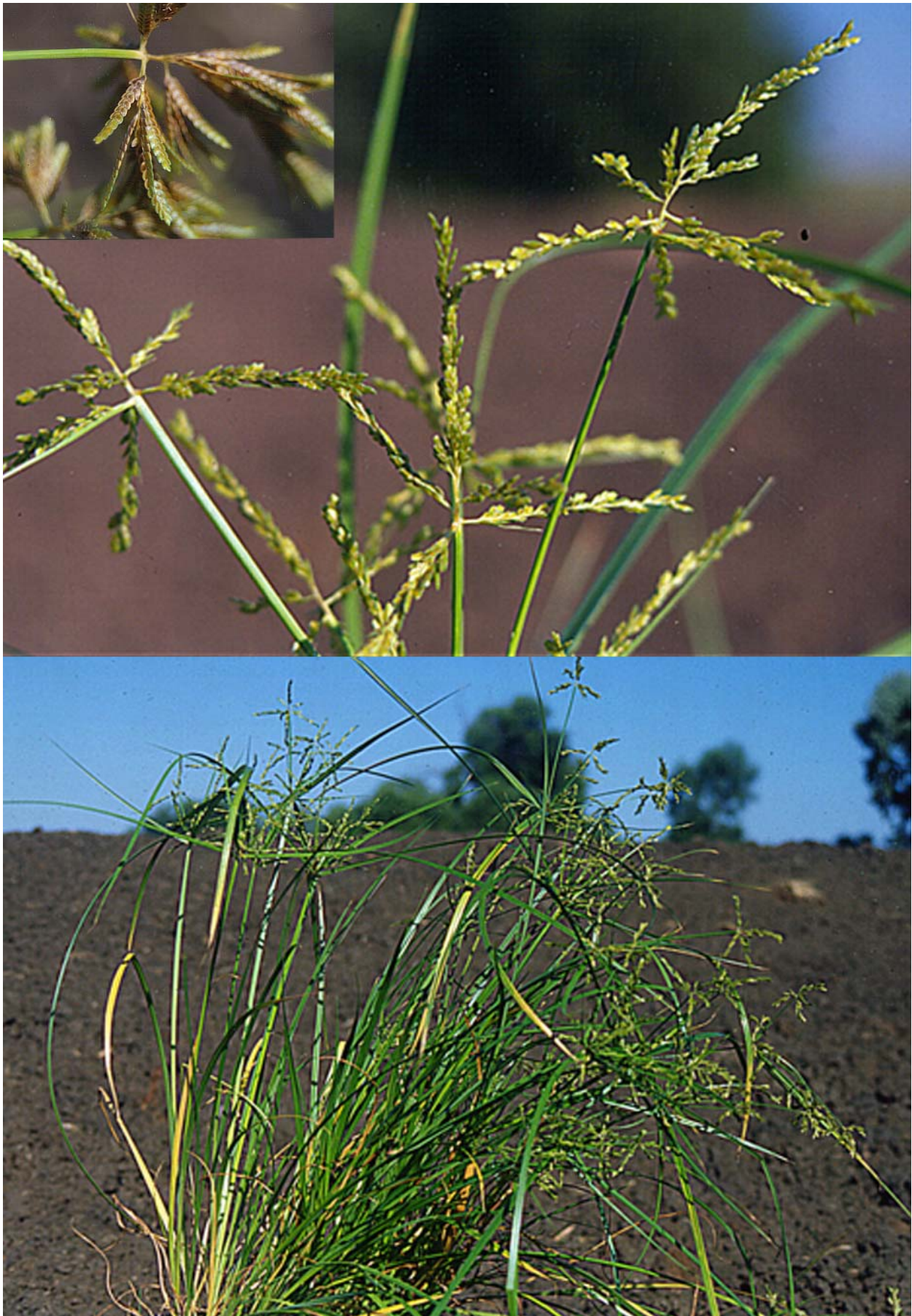
Rice flatsedge is a native species that invades wet areas.