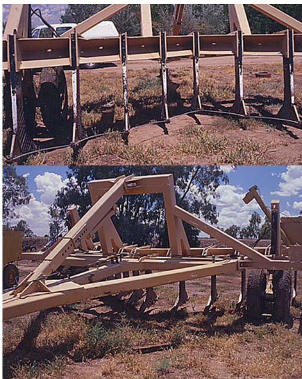
A trailing ripper set up for heavy cultivation of nutgrass after picking. Note the steel cable across the rippers (top photo) designed to cut the nutgrass roots during ripping.

Cultivation that disturbs the hills prior to planting can also be useful, as it appears to delay nutgrass emergence.