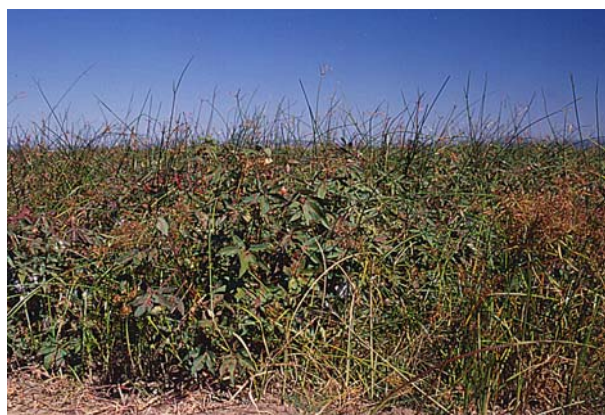
A heavy "nutgrass" infestation in cotton. The field was infested with four different species. The cotton was infested with downs nutgrass and yelka, while dirty Dora and umbrella sedge infested the head ditch.

For those using the Roundup Ready Flex ® technology, you may choose to skim through a lot of this document, but you will also find a lot of information that will assist you to get the best out of glyphosate for managing nutgrass.