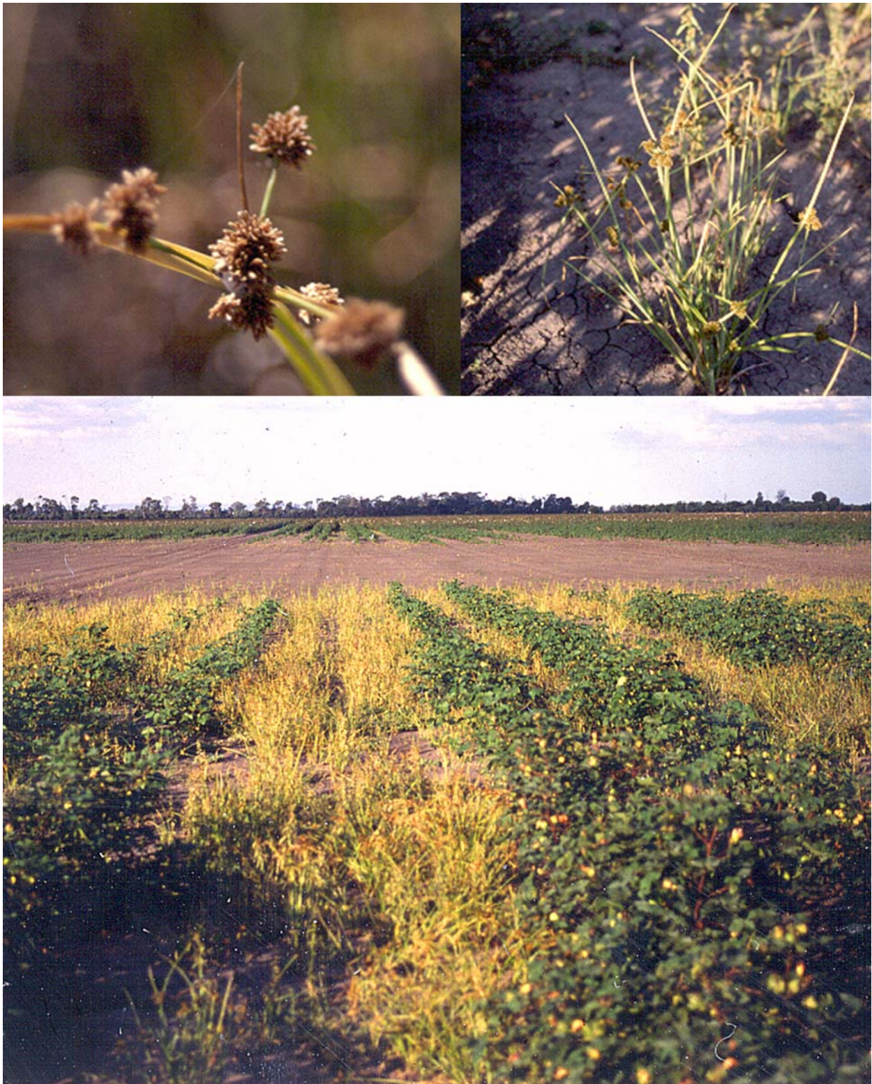
Dirty Dora is a native species that invades wet areas. It produces masses of seed and can spread very quickly.