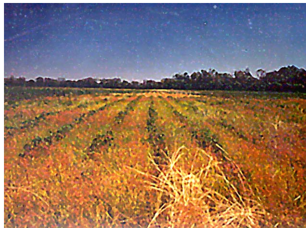
A section of a cotton crop severely infested with nutgrass. No harvestable cotton was present in this portion of the field.

Although nutgrass can compete very strongly with cotton, nutgrass does not itself tolerate strong competition. Nutgrass has a fibrous, relatively shallow root system. This enables it to compete strongly early in the cotton season and to respond quickly after rain and irrigation, but it does not compete well with irrigated cotton later in the cotton season when soil moisture in the surface soil layers is limiting.