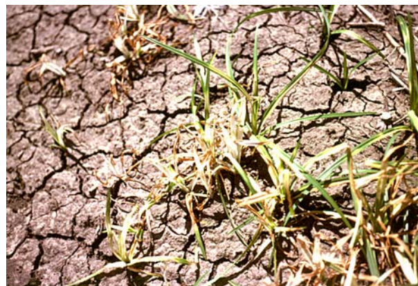
Nutgrass affected by Zoliar, as indicated by the white leaves. Most plants have been severely affected by Zoliar, and some plants in the background have been killed by the herbicide.

Zoliar is the only residual herbicide currently registered for controlling nutgrass ( Cyperus sp.) in cotton. It is highly persistent, with a half-life of up to 180 days 3 . Zoliar requires thorough soil incorporation and needs to be used over at least 3 consecutive seasons.