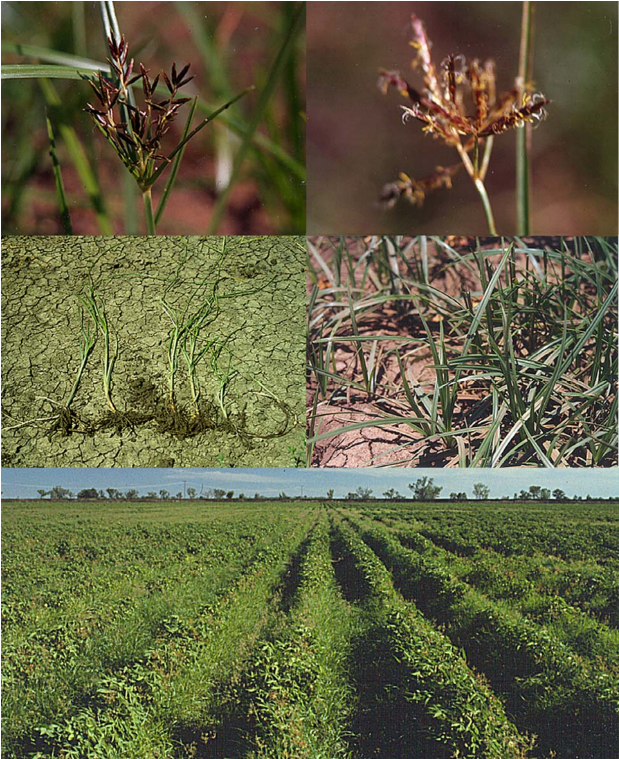
Nutgrass is a strongly competitive perennial weed that grows from tubers.