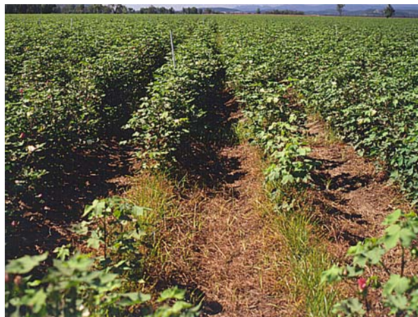
Glyphosate applied through a shielded sprayer controlled nutgrass in the furrow and controlled some nutgrass in the unsprayed cotton plant-line.

Glyphosate can be effective in controlling nutgrass. It translocates within the sprayed nutgrass plant and also to attached tubers and plants. This translocation means that glyphosate can kill the nutgrass plants it is sprayed on, but can also kill attached tubers and nutgrass plants in the cotton row that were not sprayed.