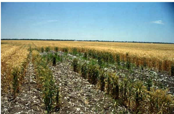
The wheat in this patch was killed by Zoliar that was applied in an earlier season.

In addition to controlling nutgrass, Zoliar controls a broad range of grass and broadleaf weeds. Zoliar is relatively expensive, but the cost can be partly offset by substituting Zoliar for some of the other residual herbicides that would normally be used. For example, the grass herbicides such as trifluralin and pendimethalin should not be required in a field treated with Zoliar.