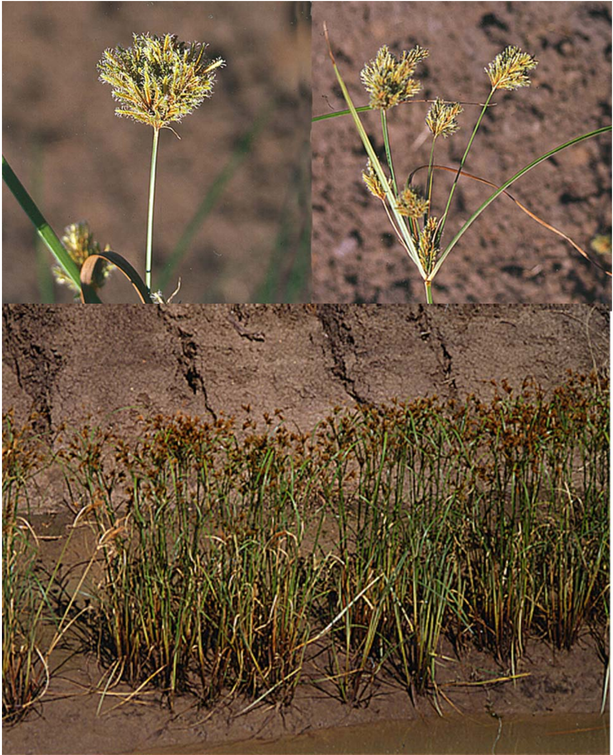
Tall sedge is a native weed occasionally found on river and creek banks, irrigation channels and water storages. It can form large, dense tussocks.