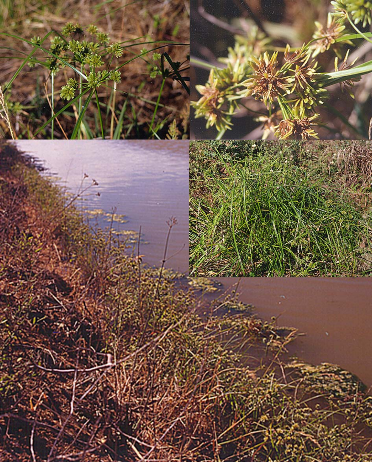
Umbrella sedge is an introduced weed that invades wet areas and spreads rapidly from seed.