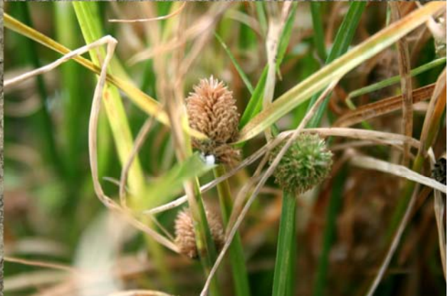
Mullumbimby couch is an introduced weed that invades wet and disturbed areas and can spread rapidly from seed and rhizomes.