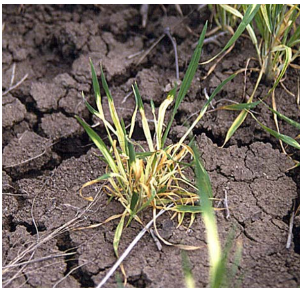
This grass plant has been affected by Zoliar, but will probably recover as some leaves are still photosynthesising.

It is common under Australian conditions for Zoliar to become less active again within a few days of the triggering rainfall or irrigation event. When this happens, the plant recovers from the herbicidal effect and resumes growing. Sections of white along the length of a leaf can indicate Zoliar activity has occurred in the past. Some suppression of nutgrass does continue at lower soil moisture levels.