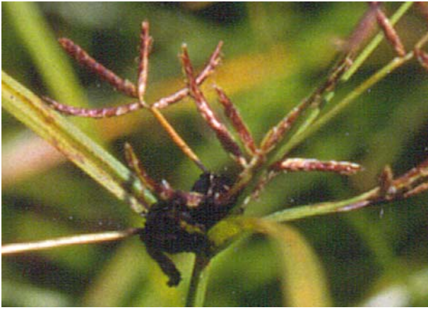
Nutgrass affected by smut. This is of little importance, however, as nutgrass spreads primarily by tubers not from seeds.