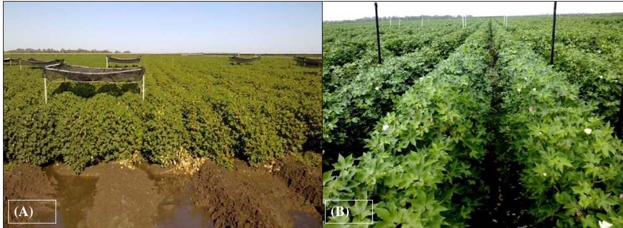
Figure (A) Field-grown crop exposed to soil waterlogging and shade, (B) changes in leaf colour after 9 d of continuous shade