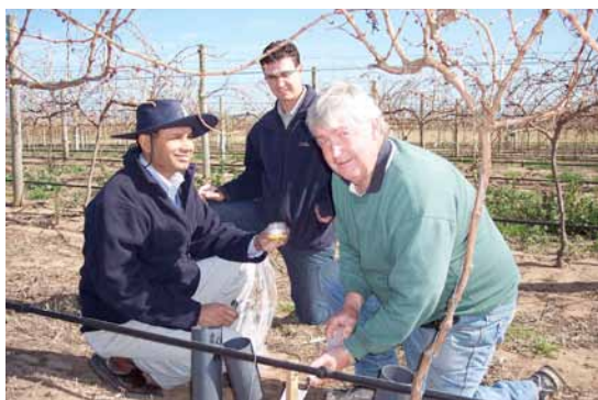
NPSI funded research at SARDI that has developed new tools for irrigators such as SoluSAMPLER for measuring and monitoring root zone drainage, salt and nutrients . Over 2000 units have been sold.

NPSI has focused on the sustainable management of water resources and utilising risk assessment and community engagement techniques to ensure that the economic, environmental and social aspects of any irrigation schemes are adequately considered.