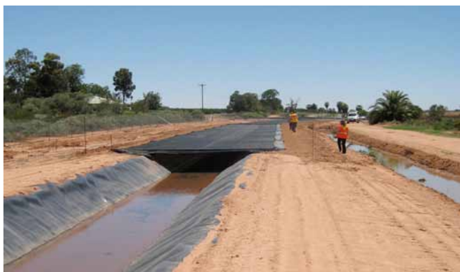
Lower Murray Water instalation of channel lining and covers to reduce evaporation.