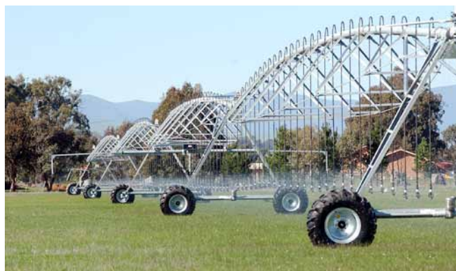
NPSI has funded many projects to improve water use efficiency and productivity.