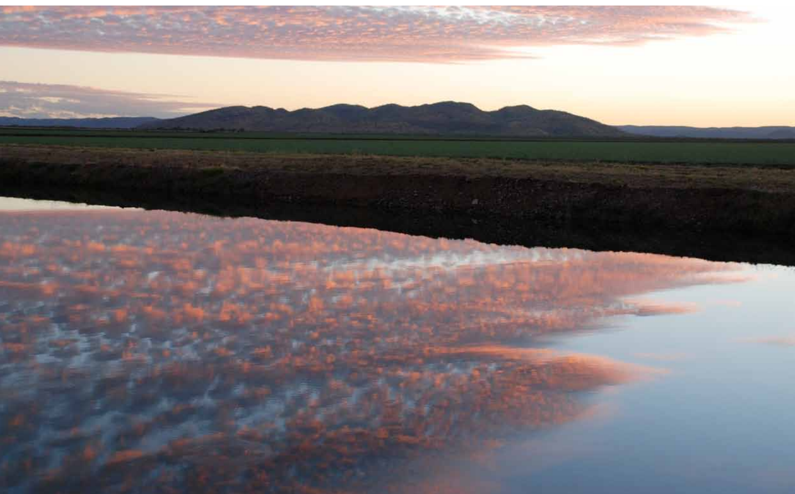
Sunset over the Ord irrigation area.