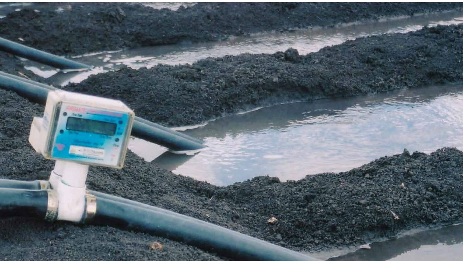
Siphon meter measuring water flows.