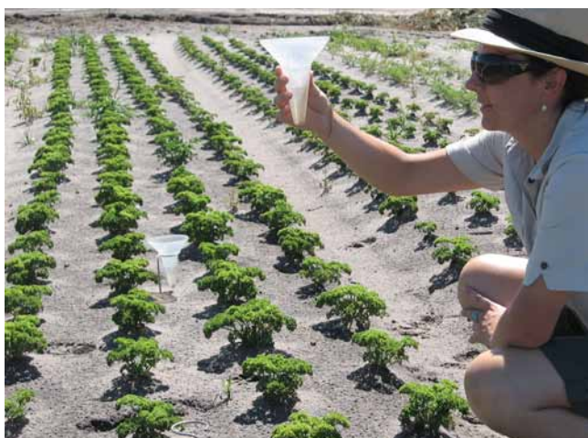
Using catch cans in vegetable crops in Western Australia to measure irrigation uniformity.