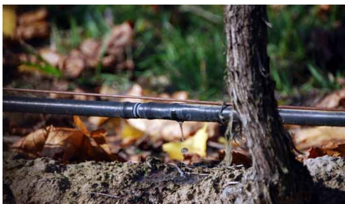
Assessing the impact of drip irrigation on soil structure and water infiltration.