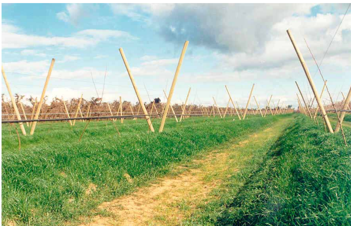
Good soil management is fundamental for water use efficiency. NPSI funded several soil management projects including the use of rye grass to invigorate soil structure in Goulburn Murray region. Other investigations included drip irrigation and soil structure in South Australia and MIA, NSW.

The quality of the research is also apparent with more than 80 scientific papers and 230 conference papers and many industry presentations/workshops arising from investment in NPSI Phase II and its predecessors.