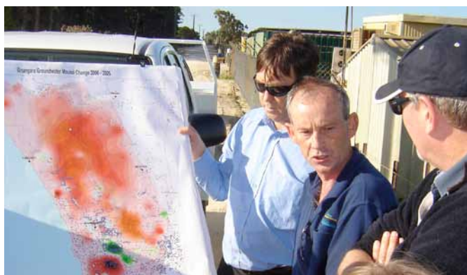
NPSI funded several projects in Western Australia including the Ord, Harvey Water, Gasgoyne, surface and ground water connectivity research, and irrigation of vegetable crops