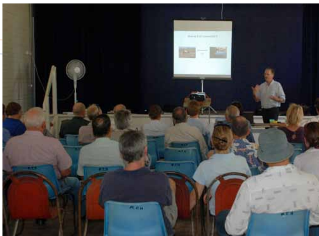
Groundwater and surface water connectivity workshop with local landholders run by UNSW at Maules Creek , Northern NSW.