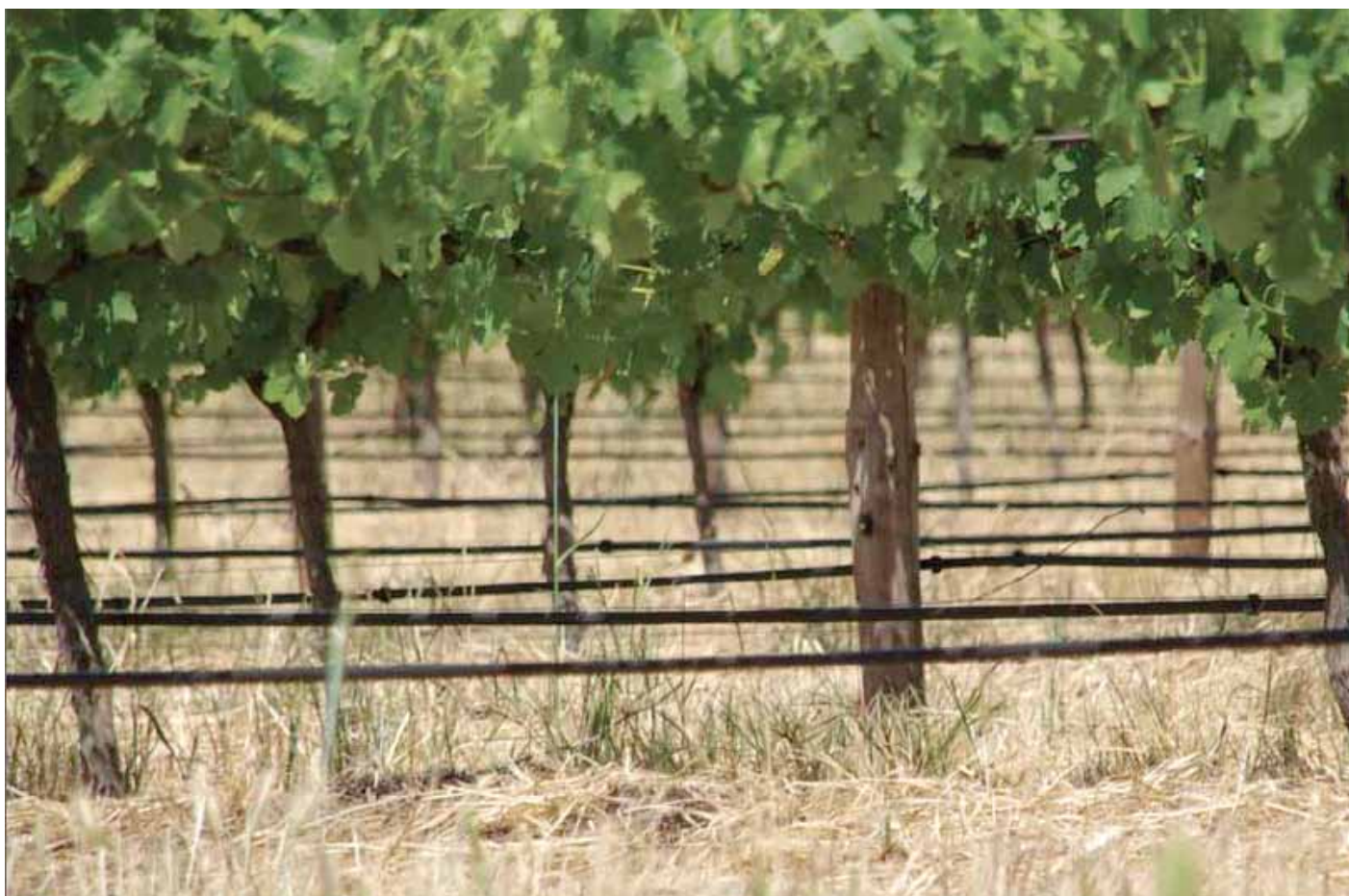
The NPSI research investigated soil management, salinity, nutrient and water use in vineyards in South Australia.