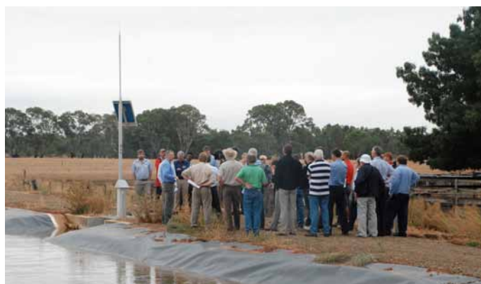
NPSI and its partners convened many forums related to irrigation modernisation such as this one in Shepparton with Goulburn Murray Water, which had people from all the major irrigation water supply companies from all over Australia.