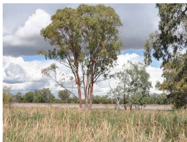
NPSI research has examined the integrated natural resource management in many industries such as rice, cotton, and sugar.