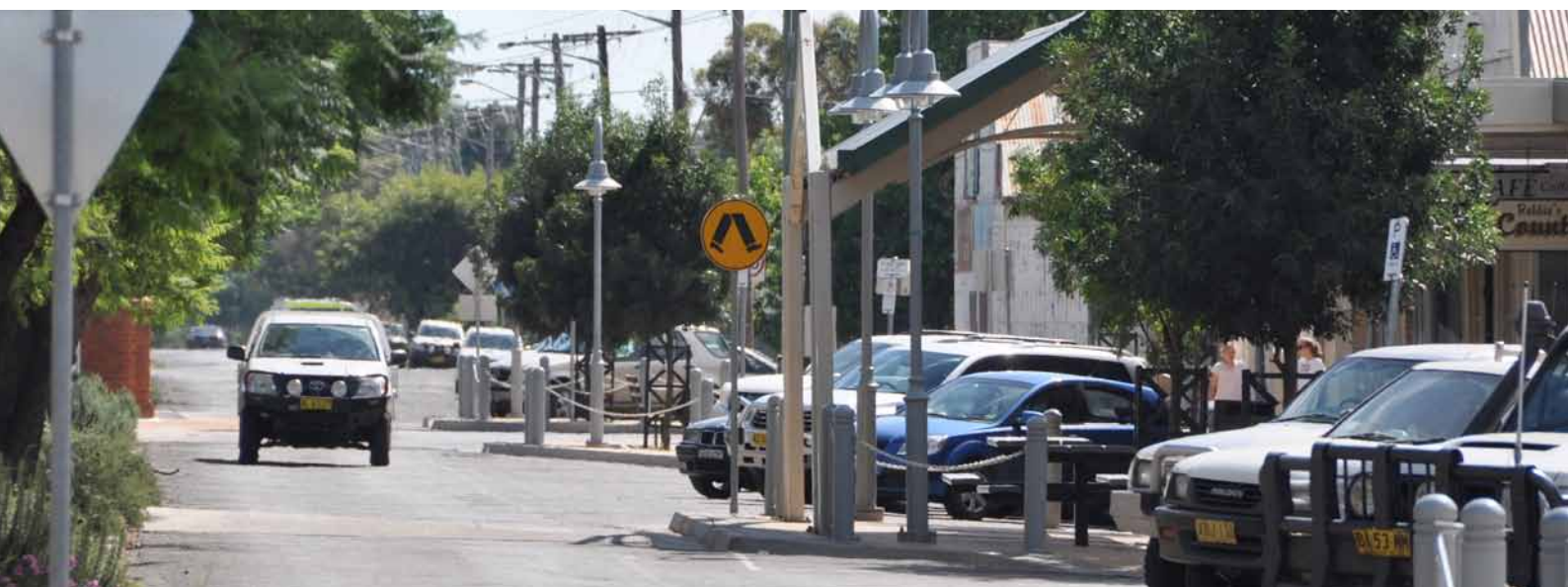
Irrigation is an important driver of rural economies.