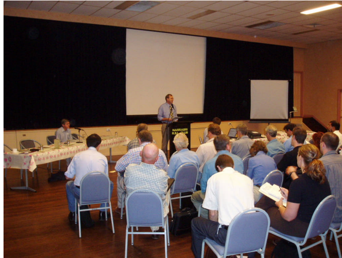
Figure 1 Animated discussion during the NMD - WBG workshop (Nov 2003) on groundwater and surface water interaction which was attended by 50 people representing 20 organisations.

to control deep drainage and to improve water use efficiency by changing irrigation practices. It is also recognised that some deep drainage is beneficial under irrigation to flush out excess salts (the so-called leaching fraction). An adequate leaching fraction is probably provided by deep drainage during rainfall except where irrigation water is of high salinity. There is also some emerging evidence from the St. George area in Queensland that groundwater tables are rising due to cotton irrigation, evidence which is similar to that found much earlier in the Macquarie valley in NSW (Willis et al., 1997).