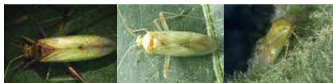
Brown mirid (L), green mirid (centre) and apple dimpling bug are known to damage squares to varying degrees and apple dimpling bug is generally regarded more as a predator of heliothis eggs and mites.

Knowledge of pest ecology can identify sources of potential infestation and non-insecticidal management strategies to control the pest before problems develop. For instance, management of weed hosts may reduce pest abundance. Consider how your IPM strategy can target different mechanisms of pest survival. For information about key pests and mites of Australian cotton go to p 5. Refer to the Cotton Production Manual and the 'Guide to Pests and Beneficials in Australian Cotton Landscapes' for more information.