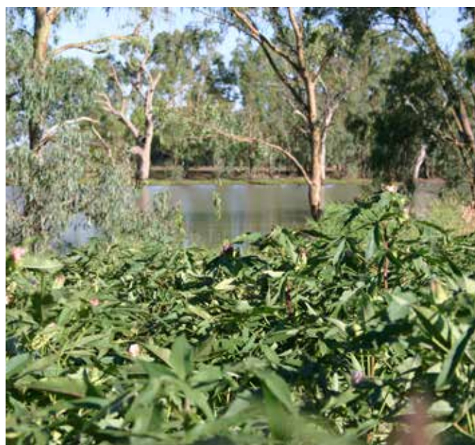
Think of the farm and surrounding vegetation as a whole system.

Another source of beneficials is native vegetation both on farms and in the region. When it comes to pest management, ‘Veg is Valuable’ as an important source of beneficials. This is especially so because these areas are permanent and usually complex, range of species and layers, and so provide continuous prey as well as habitat for beneficials year round, whereas cropped fields may be fallow for long periods. When looking to enhance IPM value of areas of vegetation consider the following: