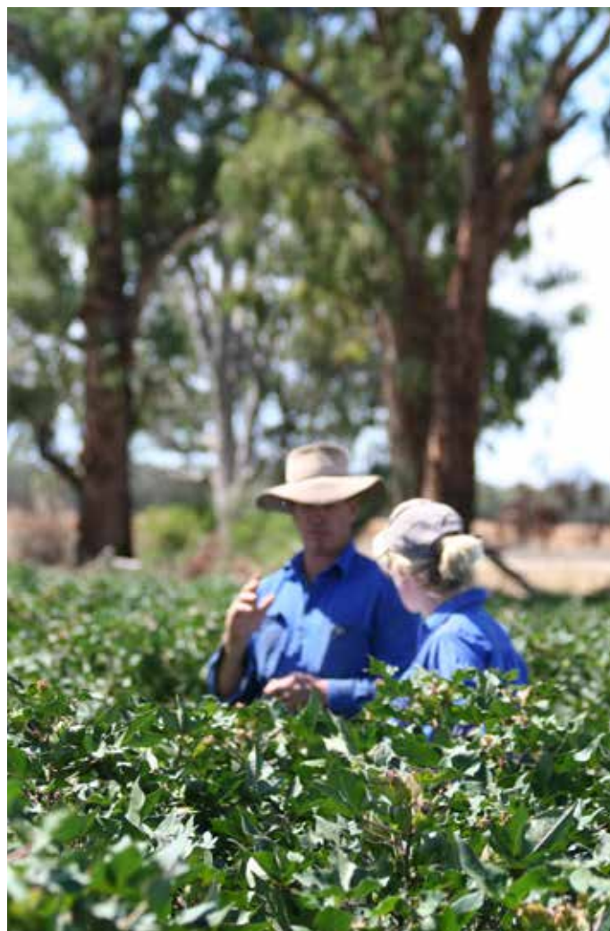
Good communication before and during the season is key to successful IPM.

Refer to Cotton Production manual for more information.