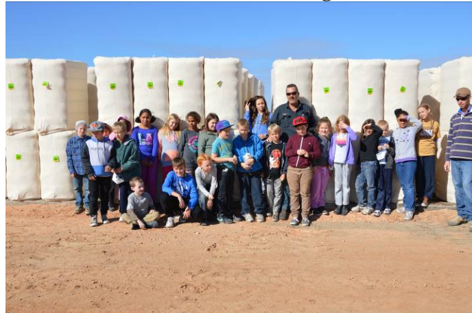
Students who visited the farm

Some Letters received from the children who visited: