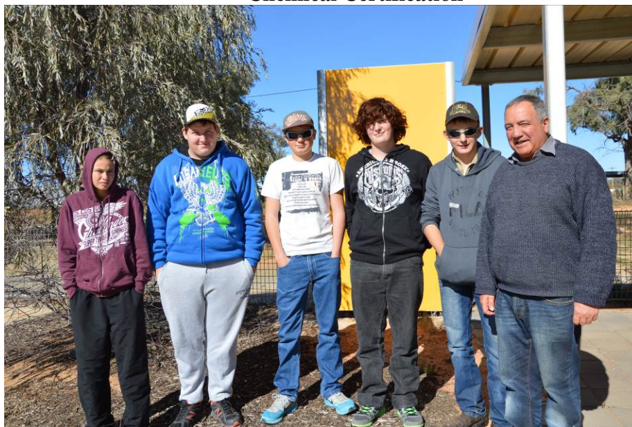
Menindee Central School Chemcert Student, with their instructor